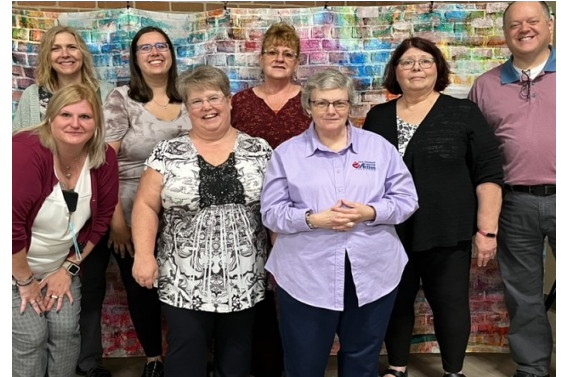
First floor Administration Office Staff