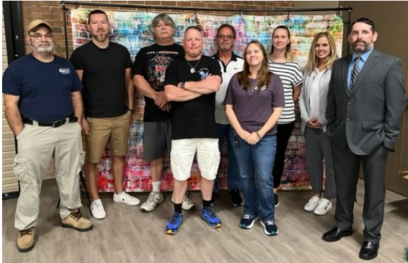
Energy Office Staff