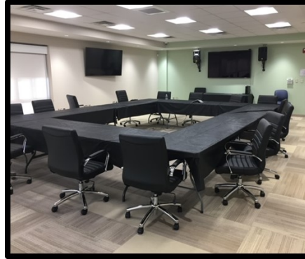
Conference room at the Jan Hulse Early Childhood Center