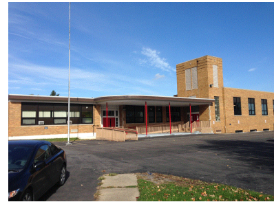
Grace St. Head Start Center 1035 Grace St. Mansfield, OH 44903