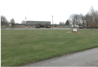
Bucyrus Center for Head Start (Holy Trinity Church) 740 Tiffin Street Bucyrus, OH 44820