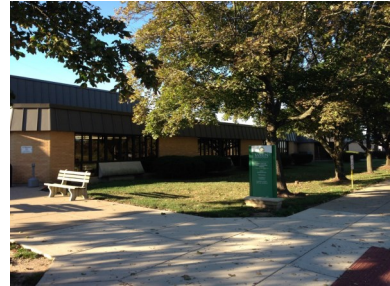
MARCA Head Start Facility (Marion Co. DD building) 2387 Harding Highway E. Marion, OH 43302