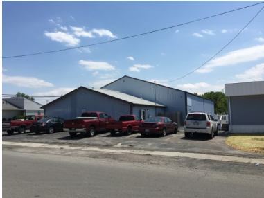
Energy Office 125 Fairview Ave. Marion, OH 43302