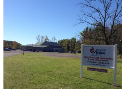
Marian Clark Center – Marion County CAC 1183 Bellefontaine Ave. Marion, OH 43302