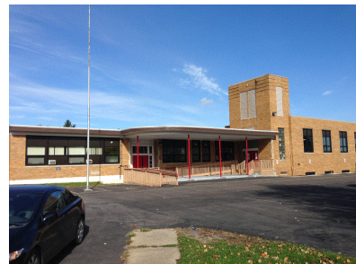
Grace St. Head Start Facility 1035 Grace St. Mansfield, OH 44903