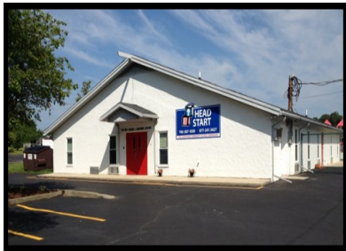
The Sam Buehrer Head Start Center 180 Fairfax Rd. Marion, OH 43302