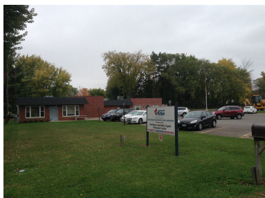
Egner Center - Crawford County 124 Buehler St. Galion, OH 44833