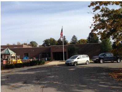
Whetstone Building 406 Banks St. Mt. Gilead, OH 43338