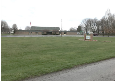
Bucyrus Center for Head Start (Holy Trinity Church) 740 Tiffin Street Bucyrus, OH 44820