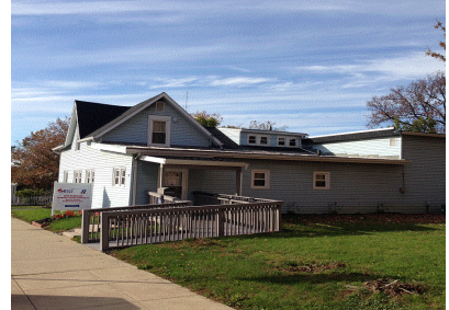
Morrow County Center 28 W. High St. Mt. Gilead, OH 43338