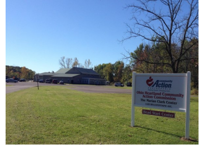
Marian Clark Center 1183 Bellefontaine Ave. Marion, OH 43302