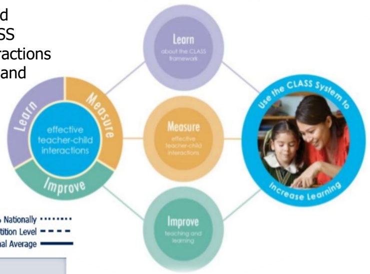
Ohio Heartland CAC Head Start